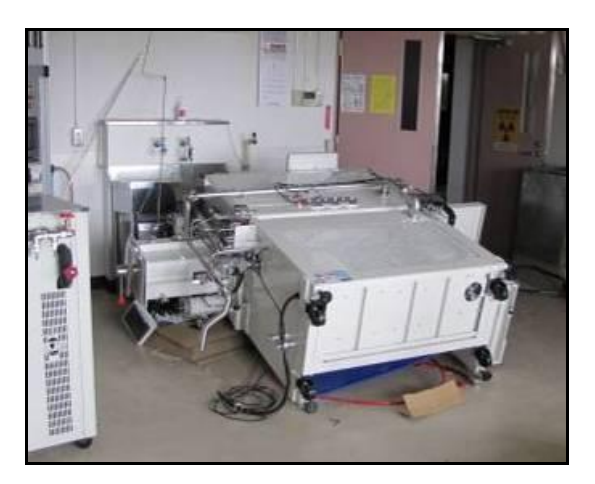
Toppled unrestrained lab workstations (2011 M9.0 Japan earthquake)

Earthquake damage of inadequately restrained equipment and building contents can dominate earthquake losses and result in a prolonged road to recovery of full operations. MRP Engineering observations following recent worldwide earthquakes demonstrate this need to protect critical equipment, utilities, and contents (see below example photographs).