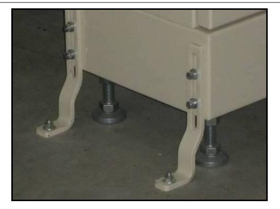
Floor-mounted manufacturing equipment anchorage