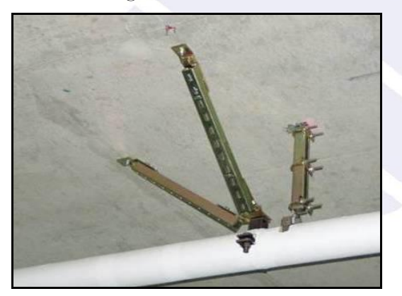
Lateral and vertical bracing for piping