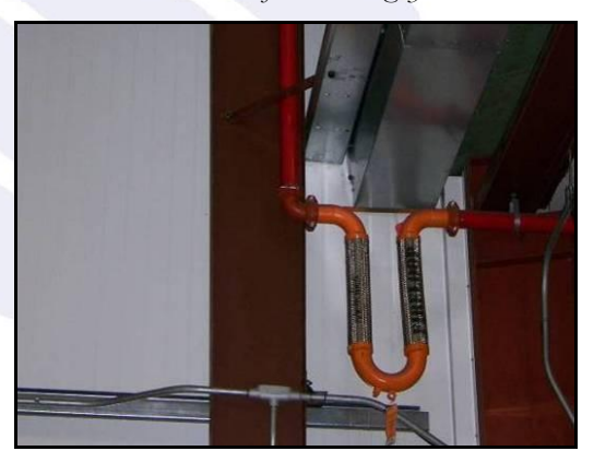
Flexible coupling for piping